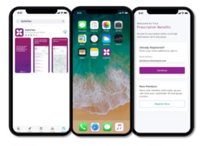
MyRxPlan change to True Rx Health Strategists

See coverage and limits. Find a pharmacy.